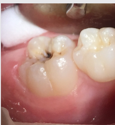
SMART With No Tooth Structure Removal